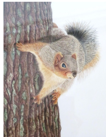
Anne Kibbler captured these “visitors in my backyard” in watercolors displayed at Emeriti House.